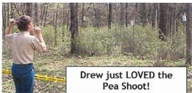
Drew just LOVED the Pea Shoot!