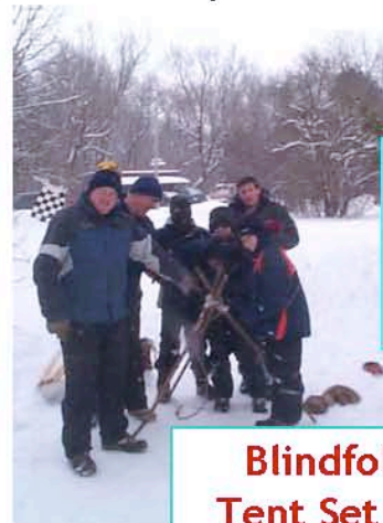
Perfect Tripod Lashing!