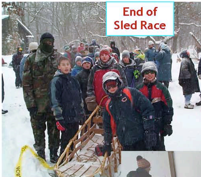
End of Sled Race