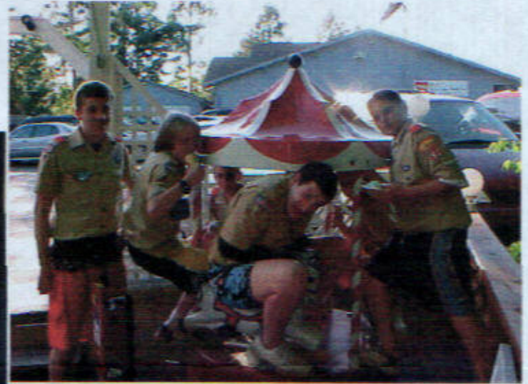
New Tent and Vestibule